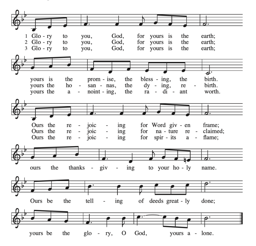
ACS Setting 12; vs. 1, 3